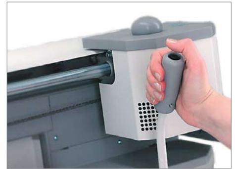
Easy and safe glue application

Fastbind Optima features an automatized glue application, which ensures even and constant binding results for on-demand or medium runs of book production and allows a "stand-by" temperature selection.