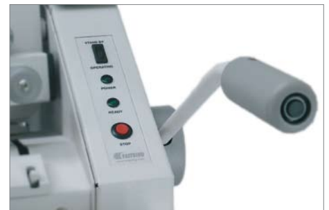
User-friendly control panel

The system self adjusts automatically to different thicknesses and page formats, allowing non-stop production between different binding jobs. There are no set-up times or book format adjustments. Anyone can be making professional quality books and reports in minutes.