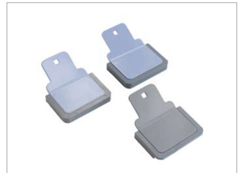
A Cover Guide and two Cover Positioning Holders are included.