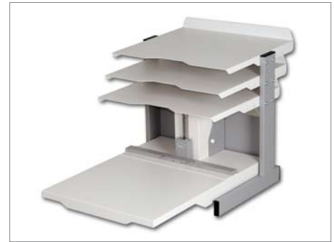
Fastbind FotoMount F46e is a compact, tabletop unit.