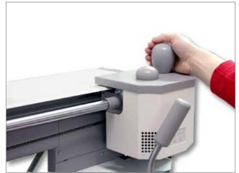
Easy to use