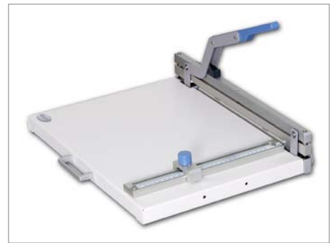
Light and compact tabletop unit.