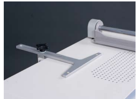
Optional side guide.