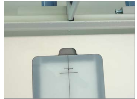
Registration marks for thicker and thinner materials offer you more versatility in applications.