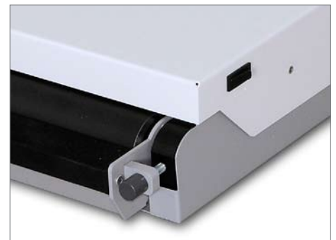
The integrated edge folding unit is adjustable for different cover board thicknesses.