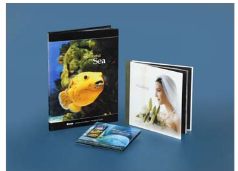
Professional customized hard covers and cases