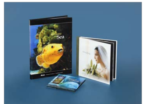
Create professional, customized hard covers and cases according to your needs.