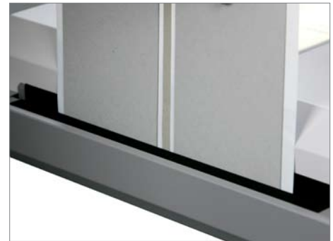
Electric edge folder.