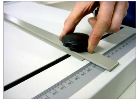
Positioning is fast and easy with measurement scale.