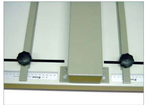
Two alignment bars.