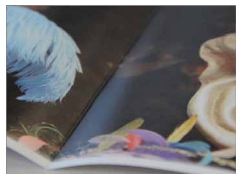
High quality crease even on photographic prints.