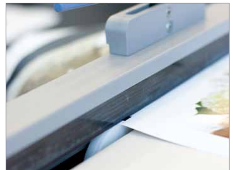
Creasing blade is visible, so it is possible to do precision creasing by visually aligning critical graphics with blade.