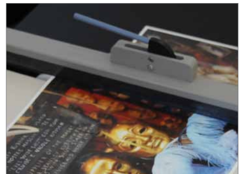
The paper is firmly secured into place with a clamp.