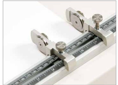
Positioning is fast and easy with measurement scale.

Manual operation (no electricity required). Product information as of December 2010 and is subject to change without notice. * Depends on material characteristics