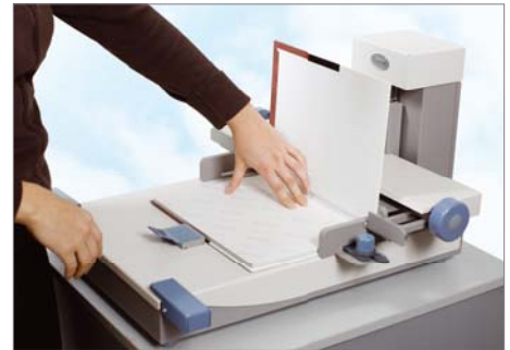
A cover guide and two cover positioning holders are included.