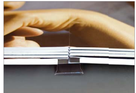
The finished book opens astonishing 180 degrees.