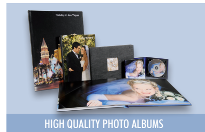
HIGH QUALITY PHOTO ALBUMS

Maping Co Kuusiniemi 10, FI-02710 Espoo, Finland Tel: +358 9 562 6022 Fax: +358 9 562 6215 Email: support@mapping.com www.fastbind.com