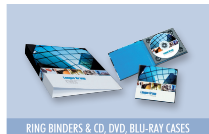
RING BINDERS & CD, DVD, BLU-RAY CASES