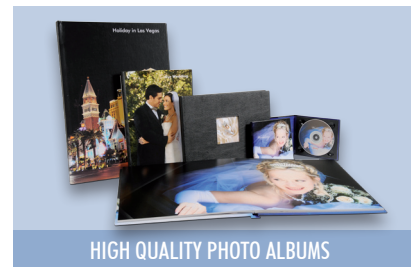
HIGH QUALITY PHOTO ALBUMS

Maping Co Kuusiniemi 10, FI-02710 Espoo, Finland Tel: +358 9 562 6022 Fax: +358 9 562 6215 Email: support@mapping.com www.fastbind.com