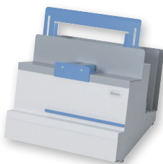
Fastbind BooXTer Uno

The Fastbind Cover Setter™ is used to add covers to books bound with BooXTer Uno™ or Trio™. The unit comes in two parts, a setter and stand. The setter plate can be mounted to BooXTer Uno™ or Trio™ to form a single workstation. Alternatively, the setter plate can be mounted to the accompanying stand to form a standalone cover setting station.