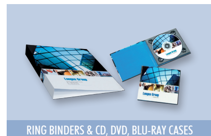
RING BINDERS & CD, DVD, BLU-RAY CASES