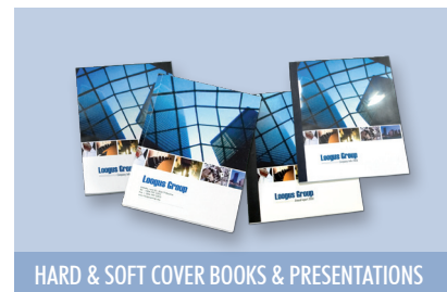
HARD & SOFT COVER BOOKS & PRESENTATIONS