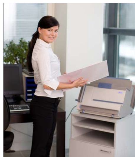
You bind professional books, reports or photo albums in a few seconds.