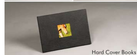
Hard Cover Books